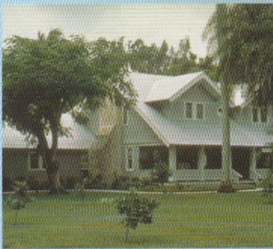
The Ford House

Tourism is the number one industry in Lee County attracting 1.8 million people from over the U.S. and world.