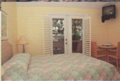
Chill out in your air-conditioned room.