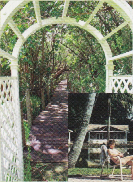
Take a relaxing stroll down a shady path.