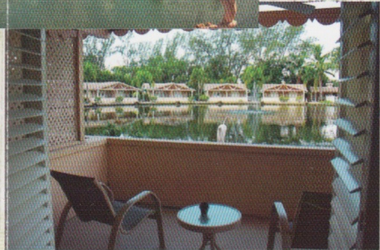
Relax with a cool drink and enjoy the charming view from your porch.