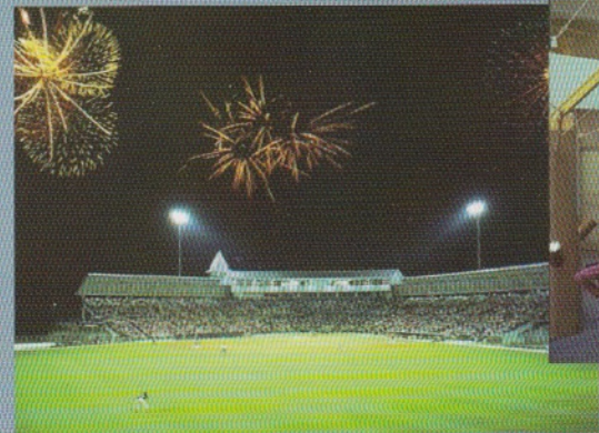
The Boston Red Sox Park