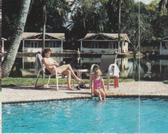
Keep cool with a dip in the pool.