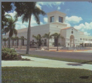
Harborside Convention Hall

Rock Lake Resort 1/2 mile east of downtown Fort Myers, Florida