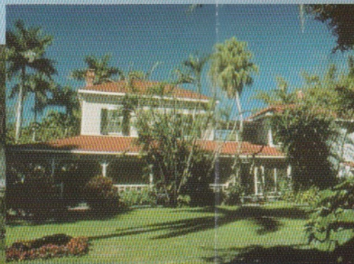
The Edison House